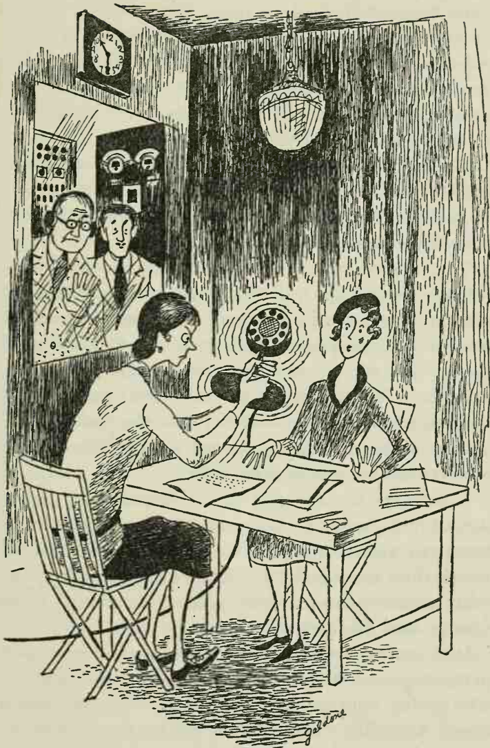
From time to time she picked up the mysterious metal disk and gave it a severe shaking